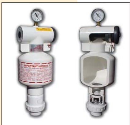
Vac-Alert™ Model VA-2000 SVRS, with cutaway showing the interior.