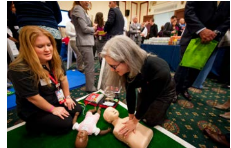
Nurse from Children's National Medical Center in Washington, DC demonstrates AED use and compressions at a Capitol Hill event.