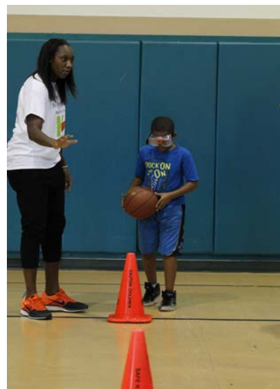
WNBA New York City Liberty player Tina Charles coaches a young man wearing concussion goggles through an obstacle course at a sports safety event

Having a neurologist, sports medicine doctor and/or athletic trainer on hand to answer questions is a great idea and opportunity to partner with healthcare institutions in your district.