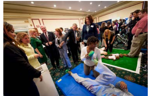
Certified Athletic Trainer teaches stretching exercises at Capitol Hill event.