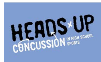
Sample of CDC HEADS UP materials: this is a wallet card for coaches. Among hand-outs you can provide at the clinic.

Sports safety is an area that all of us can work on together. A Member of Congress may consider holding an event in their district, and could do so in partnership with others in the community such as children's hospitals, schools and PTAs, brain injury associations, safety organizations, sports associations, and many others. Safe Kids Worldwide, a network of more than 500 coalitions around the nation— find them in your state —hold hundreds of sports safety clinics throughout the country and are often looking for ways to engage partners. The Safe Kids' national office in DC is more than happy to introduce you to your local coalition leaders, write us at agreen@safekids.org